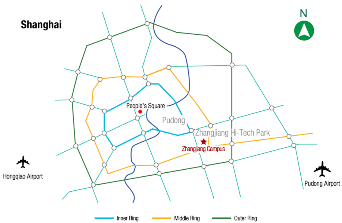
Location of ShanghaiTech University in Shanghai at its Zhangjiang Campus.

ShanghaiTech University is located in Shanghai, China. Its campus is in Pudong in the Zhangjian Hi-Tech Park.