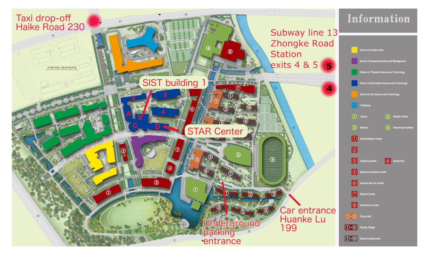
ShanghaiTech Campus Map

Arriving by taxi (see the taxi printout card on the last page) you will either be dropped off at the taxi drop-off at Hauke Road 230 (on top) or the taxi driver might alternatively bring you to the car entrance at Huanke Lu 199. Please walk through the campus to the SIST building number 1 to then find the STAR Center in the 2<sup>nd</sup> floor of building wing D .